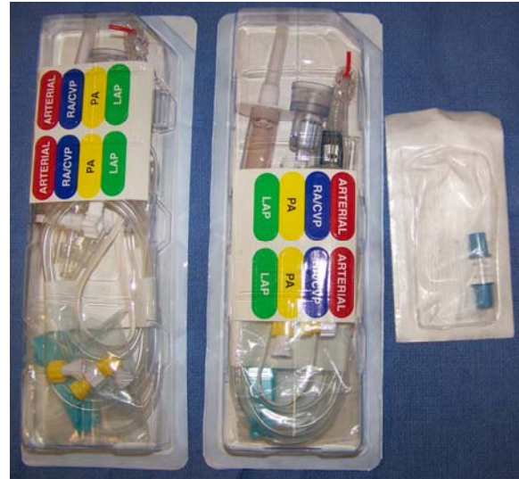
Transducers Bottom View