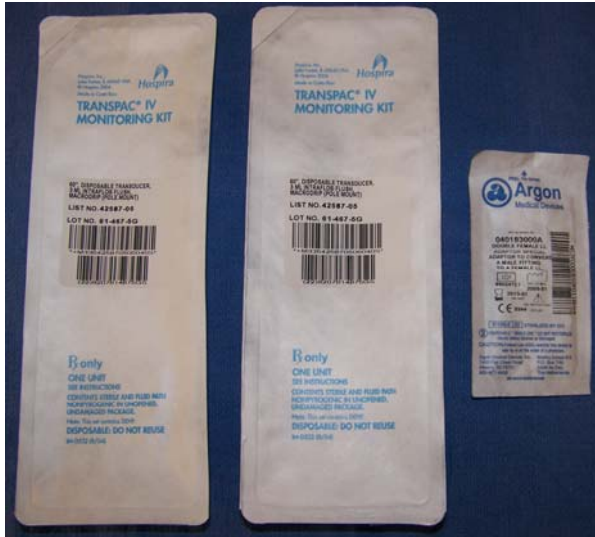
Transducers Top View