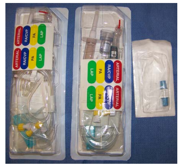
Transducers Top View